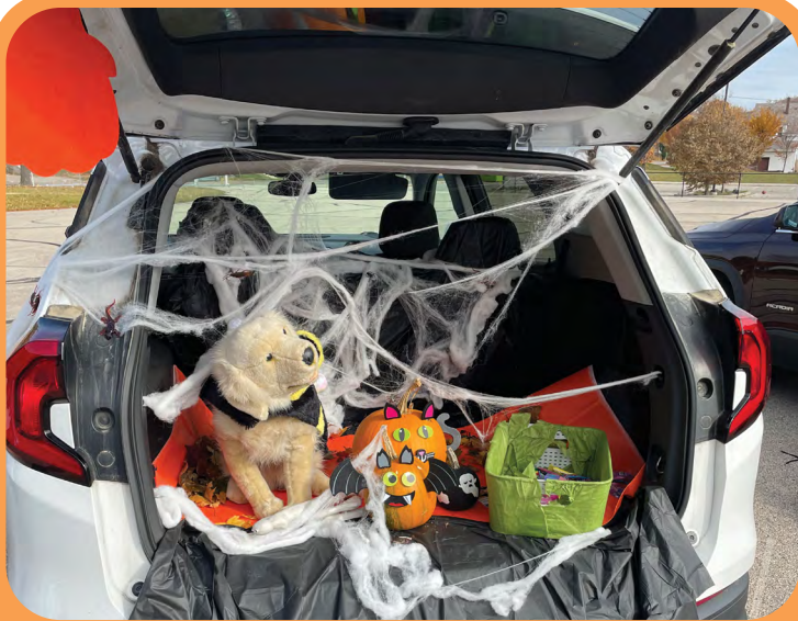
WHS attended Auer Avenue School's Halloween "Trunk or Treat" this fall, offering goodies to the kids!

Through the partnership, students ranging from kindergarten to grade 5 learn about important topics such as animal safety, caring for pets, and careers in animal welfare. The partnership consists of both in-class programs and field trips to our Milwaukee Campus. Students get the opportunity to meet some furry friends and see firsthand how animals are cared for in a shelter environment. The Auer Avenue School Youth Council (a leadership group for young people in Grade 5) has the opportunity to meet with a panel of our staff and learn about career opportunities in animal welfare. We are excited to expand this partnership to increase our presence for families in the community.