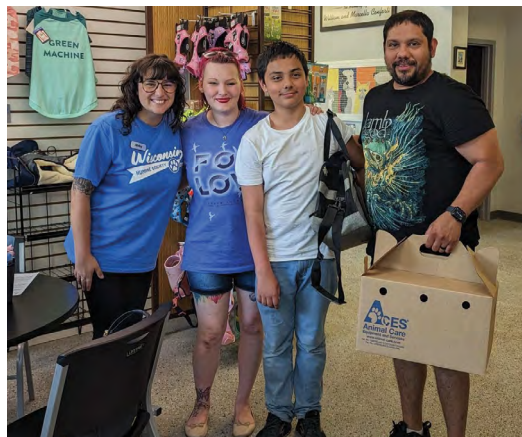
First adoption at WHS Kenosha Campus

The team has been working tirelessly to accomplish so much already this summer, and we have even more in store for the future. We're grateful for your patience and support as we continue to fine-tune our processes and assess our services. WHS is so grateful to be a part of the Kenosha community and we hope to see you soon!