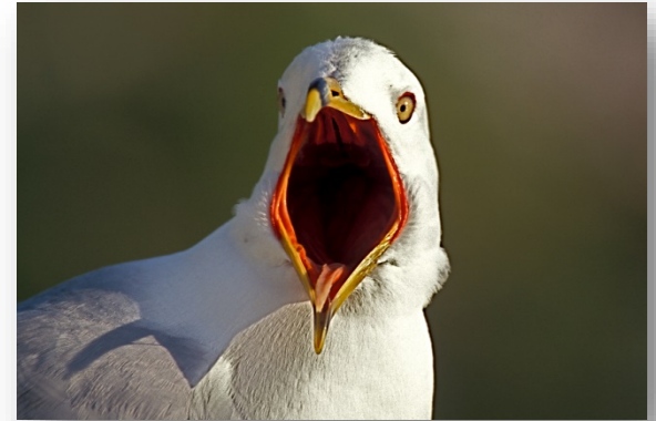
This nesting Ring-billed Gull is vocalizing its displeasure at an approaching human.

You may be able to hold a shirt or towel in front of you like a bull-fighter's cape to herd the bird to safety. Please, if it is not safe for you to intervene, consider calling the police or a licensed wildlife rehabilitator for help. If you are uncertain about a situation, call a licensed wildlife rehabilitator in your area for advice. If you are in Milwaukee County, call us at (414) 431-6204. If you choose to capture the bird, you can refer to our Sick or Injured Birds page on our web site for tips.