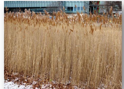
Tall grasses or other plants limit gull's ability to watch for potential predators so gulls usually avoid these areas.