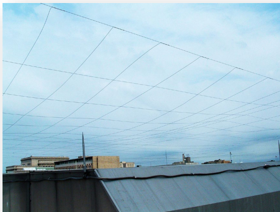
This is an anti-gull-colony wire grid erected above the roof of a very large commercial building in downtown Milwaukee.