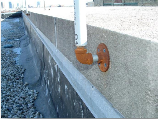
For this grid, some of the perimeter poles that hold the lines are mounted on pipe flanges.