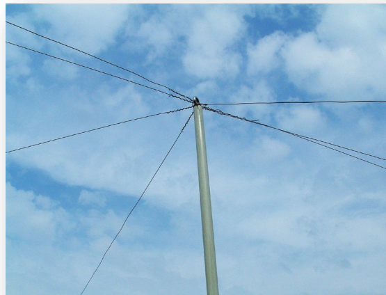
This fiberglass center pole supports several wires in this anti-gull-colony wire grid over the roof of a commercial building.