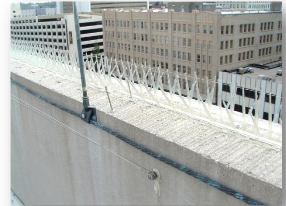
"Bird spikes" can help keep gulls from roosting on ledges and walls.