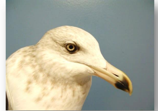
Both Herring Gulls (above) and Ring-billed Gulls nest in Wisconsin.

Encourage your tenants to keep the dumpster lids closed at all times, and ask them to make sure that all garbage makes it into the dumpster, not on the ground nearby. Any garbage on the ground or in an open receptacle will attract foraging gulls.