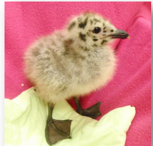
Like most parents, gulls can be highly protective of their young.