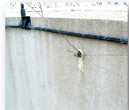
The ends of grid wires or lines may be anchored to the building's perimeter wall, as shown here.