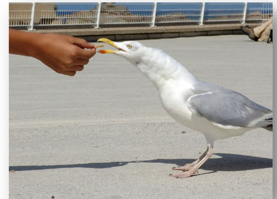
Feeding gulls will often lead to them lingering in areas where they, and their droppings, are not appreciated by everyone.

Restrict Gull Feeding : people feeding gulls intentionally or unintentionally (e.g. cleaning fish at dockside and tossing the entrails in the water) in the general area around your boat can attract gulls, which may hang around waiting for another hand-out.