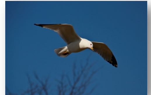
Gulls are scavengers and may travel long distances to find food.