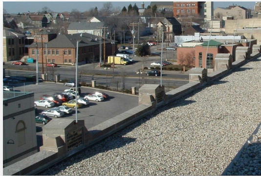
PVC perimeter poles suspend braided fishing line above the roof of this Milwaukee school to repel nesting gulls.