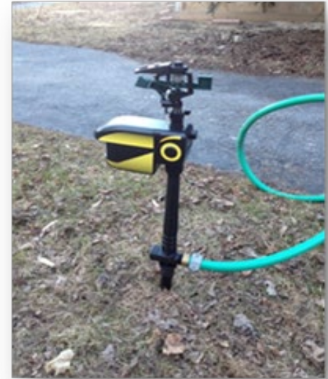
The Scarecrow® motion-activated sprayer can help keep gulls away from rooftop gardens and patios.