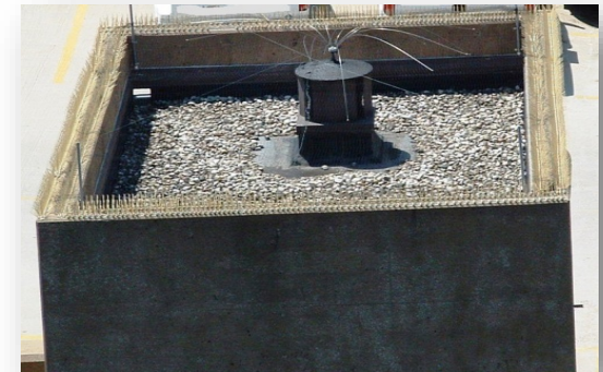
A Bird Spider® on top of the vent, Bird Spikes on the perimeter wall and crisscross wires keep gulls off of this rooftop vent tower.