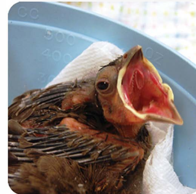
◀ Nestling Northern Cardinal