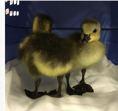
Canada gosling ▶