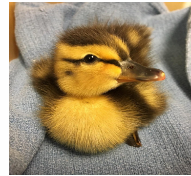
◀ Mallard duckling

Please call your local licensed wildlife rehabilitator for help. In Milwaukee County, please call (414) 431-6204 to leave a message for our Wildlife Hospital staff. 🐾