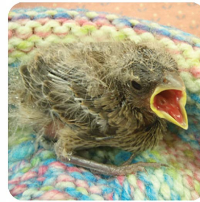
◀ Nestling House Finch