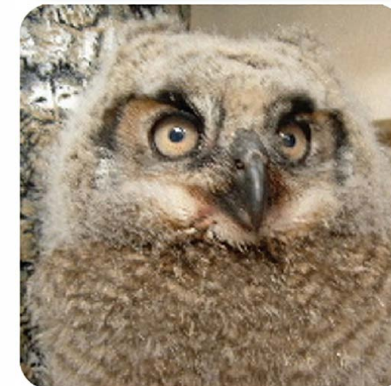
◀ Great Horned owlet