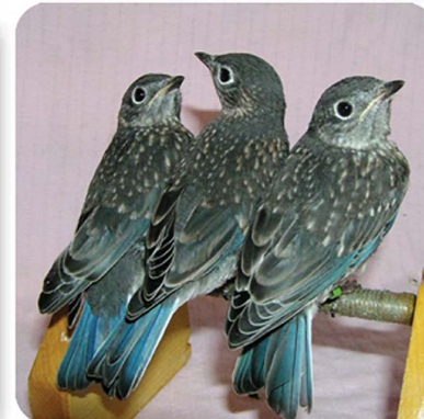
Fledgling Eastern Bluebirds ▶