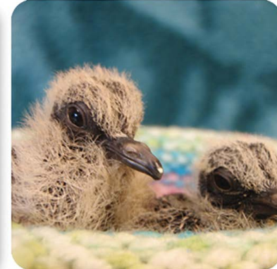
Nestling Mourning Doves ▶