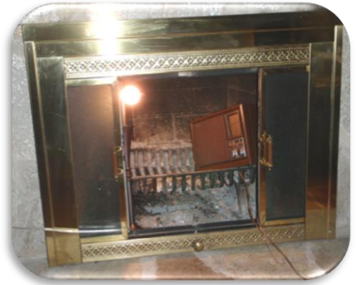
A bright table lamp with the shade removed and a portable radio placed in the fireplace to try get a raccoon to move out of a chimney

A bird that has fallen all the way down to the bottom of your chimney will be unable to escape on its own and will die unless you give it another way out. To save this bird you'll need to open the damper during the daytime to let the bird come down out of the chimney and into the fireplace. But before you do this, close all of the draperies or blinds in the room and close any doors to adjoining rooms. Get people and pets out of the room and turn off sources of noise like the radio and TV set. Fully open either a door to the outside or a window. Then open the fireplace curtain or doors, turn out the room lights, open the fireplace damper (the flap between the top of the fireplace and the chimney) and leave the room or go sit quietly in a location where the bird cannot see you. The bird should soon see the light coming in and drop down into the fireplace through the damper and then out the open window or door to the outside.