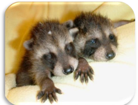
Helpless babies, like these tiny raccoons, will be badly injured or killed if you try to smoke them out of a fireplace chimney!

Note: please see our insert about Chimney Swifts on the last page.