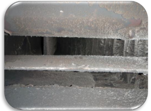
Though fireplace damper styles vary, this is what a typical damper looks like in the "open" position. This view is looking straight up from inside the fireplace.

An alternative to letting a bird fly out of the house is to use a fine-meshed net such as a butterfly net to capture the bird while it is still inside the fireplace. To do this, open the fireplace curtain or doors just wide enough to squeeze through the opening with the net and try to net the bird and carry it in the net outside. One drawback to this technique is that the bird may become frightened by the net and fly back up through the damper and into the chimney.