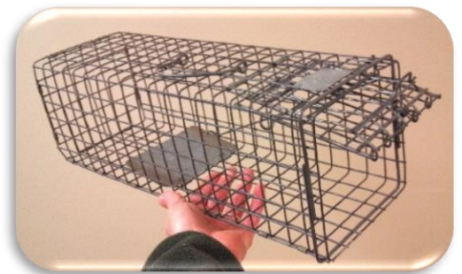
A live trap can aid in rescuing a squirrel that has fallen into your chimney and fireplace

If you don't want to let the squirrel run out of an open door or window, use a live-trap in the fireplace instead. Bait the live-trap with a dab of peanut butter and place it in the fireplace. Keep it quiet in the room and in time, the squirrel's fear should subside enough for it to come down from above the damper and check out the peanut butter in the trap. Once it is captured in the trap, carry the trap outdoors.