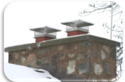
These chimneys have had sturdy, stainless steel chimney caps installed

Open chimneys resemble a hollow tree enough to attract these species. Some animals, like raccoons, can usually climb in and out of a chimney at-will. Other species, like squirrels, are seldom able to get out on their own. Any bird that gets into a chimney (other than Chimney Swifts, who build a small nest attached to the inside of the chimney) will NOT be able to get out on its own! These animals will die unless they are rescued or given an alternate means of exit.