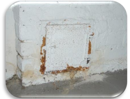
A typical clean-out door at the bottom of a chimney in the basement. These usually measure about 12" x 12". This one doesn't look like it has been opened in many years and is rusting around the edges.